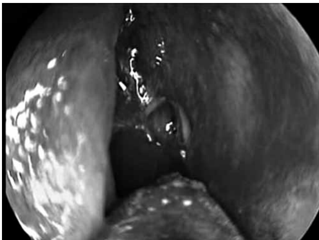
Fig. 3. Size of an ostium at postoperative month 24.