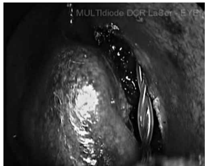
Fig. 2. Bicanalicular silicone intubation stenting.